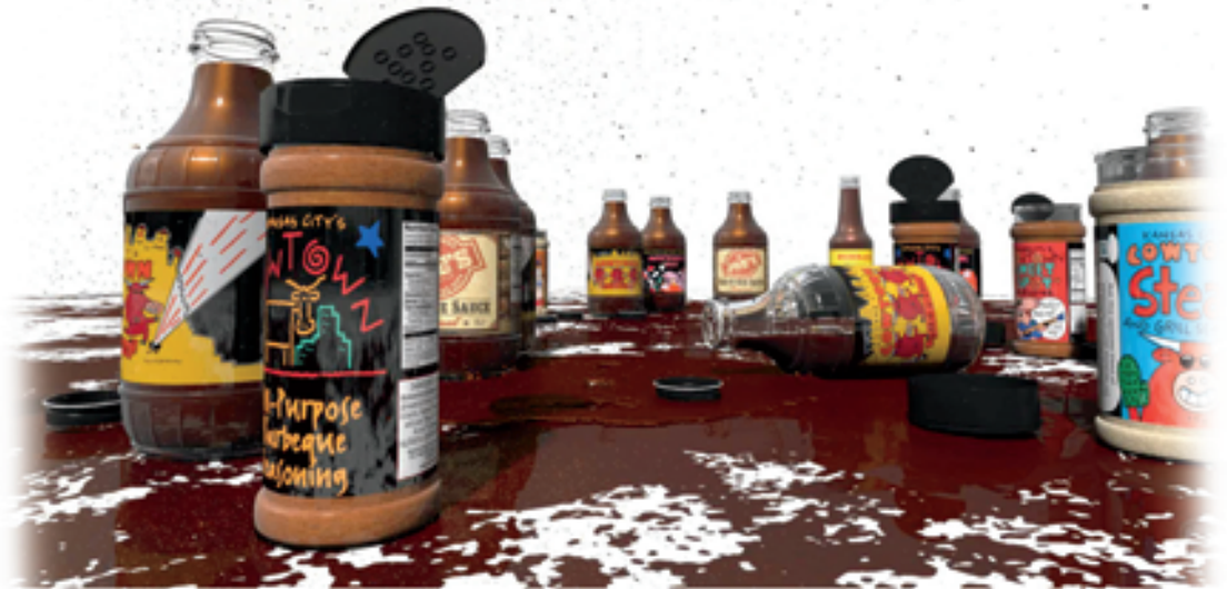
Pictured above: Animation of Cow Town's sauces and spices. A story is acted out by the products of a fight and wedding in less than 60 seconds.