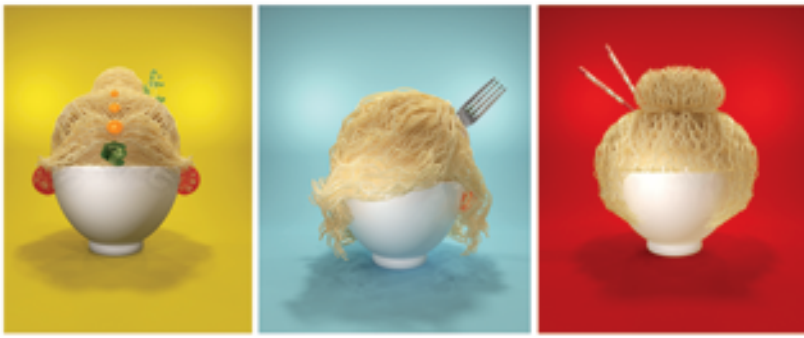
Pictured above: Pasta advertising for Saatchi and Saatchi.