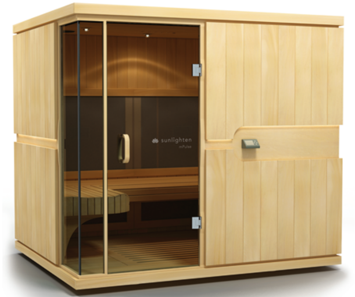
On this page: Sunlighten Saunas marketing materials.

"We've been working with Trinity Animation for over a year and we're delighted by their attention to detail, fast turnaround time, industry knowledge and friendly team. We often say that..."